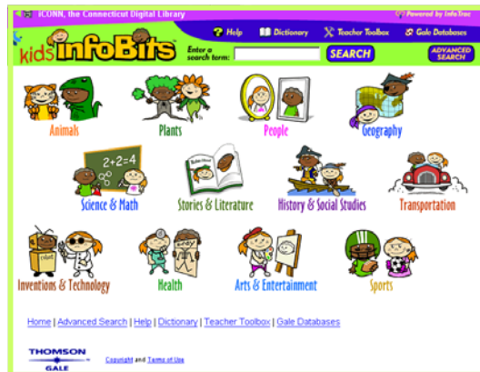
Kids InfoBits—Main Search Page

iCONN has been upgraded to include Kid's InfoBits, a new K-5 database from the Gale Group that will replace InfoTrac Kid's Edition on July 1, 2003. Until then, both the new and previous versions of this resource for K-5 students will be available. Kids InfoBits targets the research needs of students in Kindergarten through Grade 5. It features a developmentally appropriate and visual graphic interface, a subject-based topic tree search and full-text, age-appropriate, curriculum-related magazine and reference content.