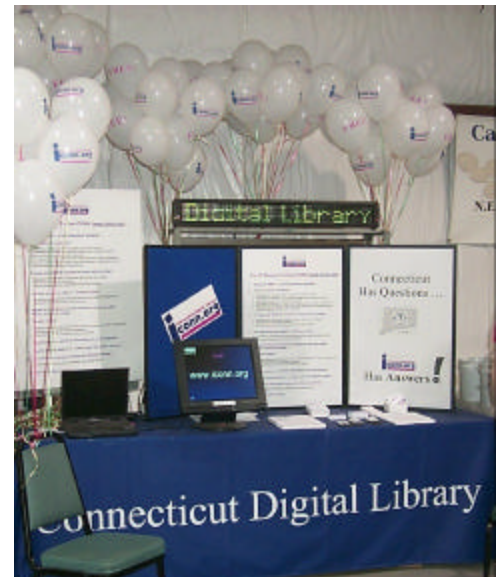
The iCONN Booth at the Durham Fair